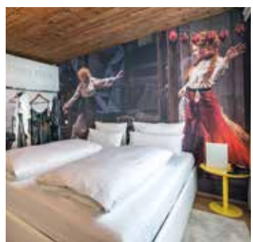
The bold decor at Hotel Goldgasse : A traditional Salzburg treat

The centrally located threestar Hotel Hofwirt (hofwirt.net: B&B from £69) offers recently renovated, compact bedrooms.